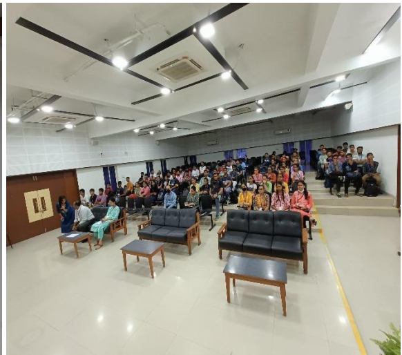
Students attending the first day of workshop