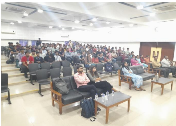
High Sky Team with students