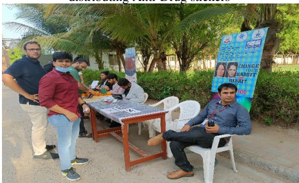
HCC spreading awareness during "Farewell Party of 2018 Batch"