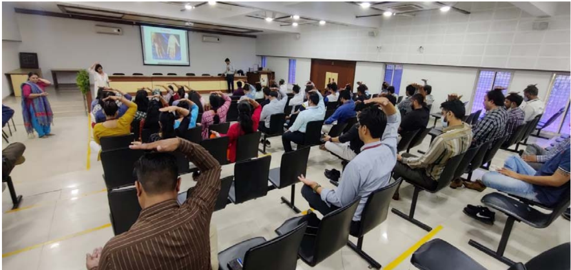
Participants enjoying a feeling of internal energy after the meditation process