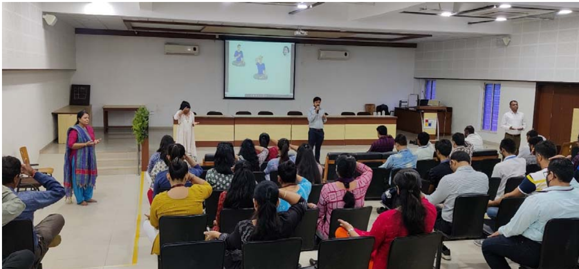
Meditation performance by all participants