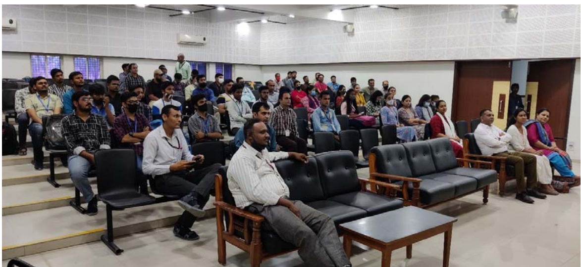
Group Photo of Session