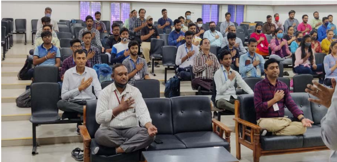
Experience of Meditation exercises by participants