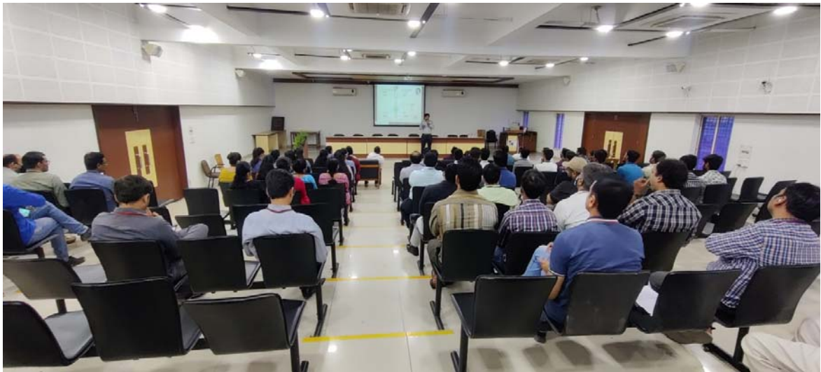
Participants listening expert about importance of Yoga