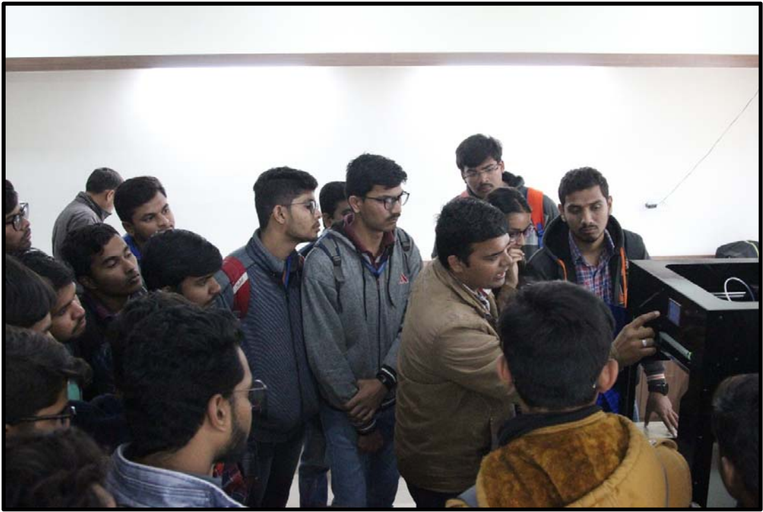
Hands on exercise on 3D printer