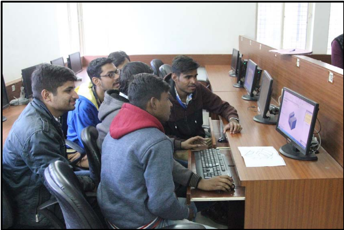
Participants preparing their 3D model