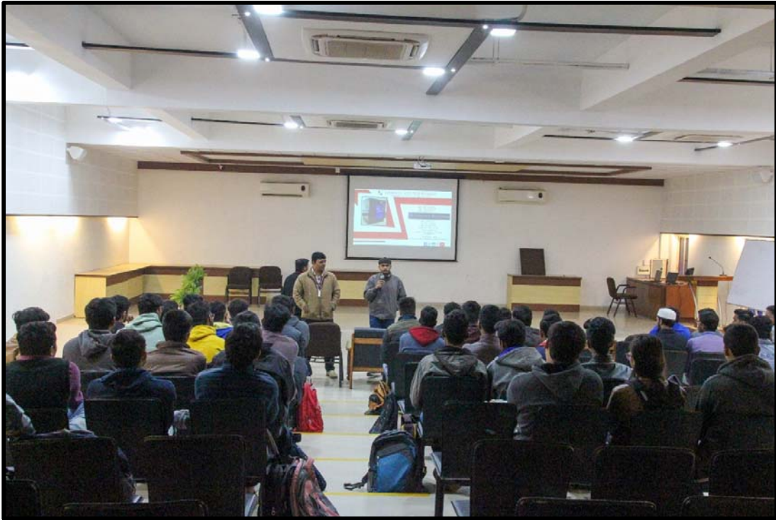
Interaction between participants & mentors