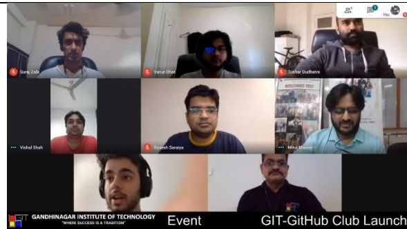
All attendees of the livestream