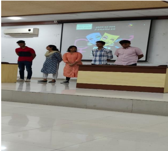
Students giving the Message to the Society