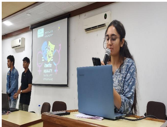
Introductory Speech of the performance