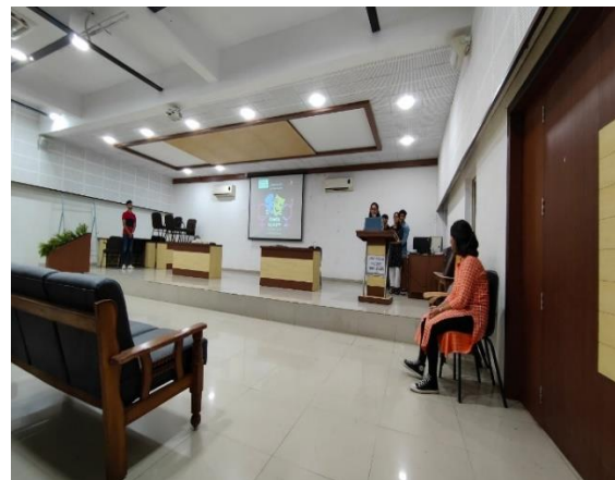
Beginning of the Performance