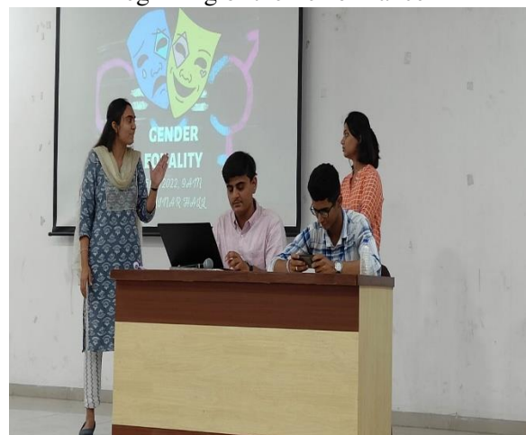
Students Performing the Drama in Scene 2