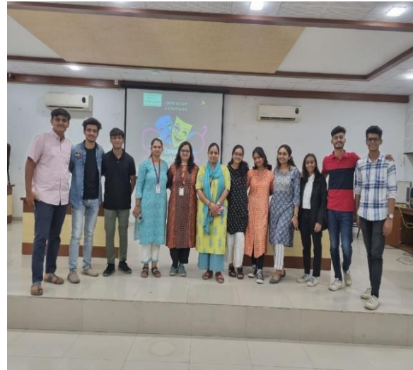
A Group Picture of WDC Team along with Participants