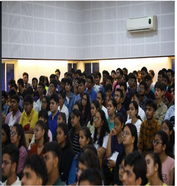
Actively participated by Newly admitted students