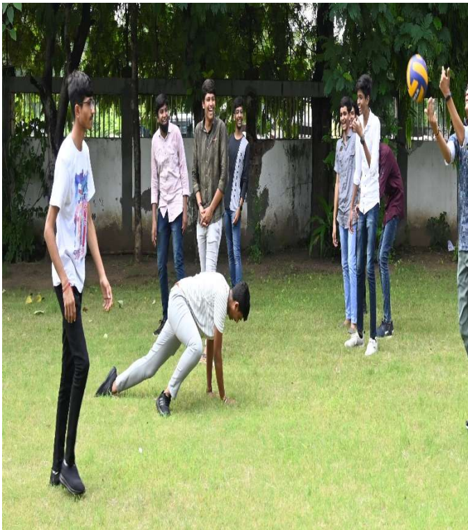
Actively participated in Sports activity by Newly admitted students