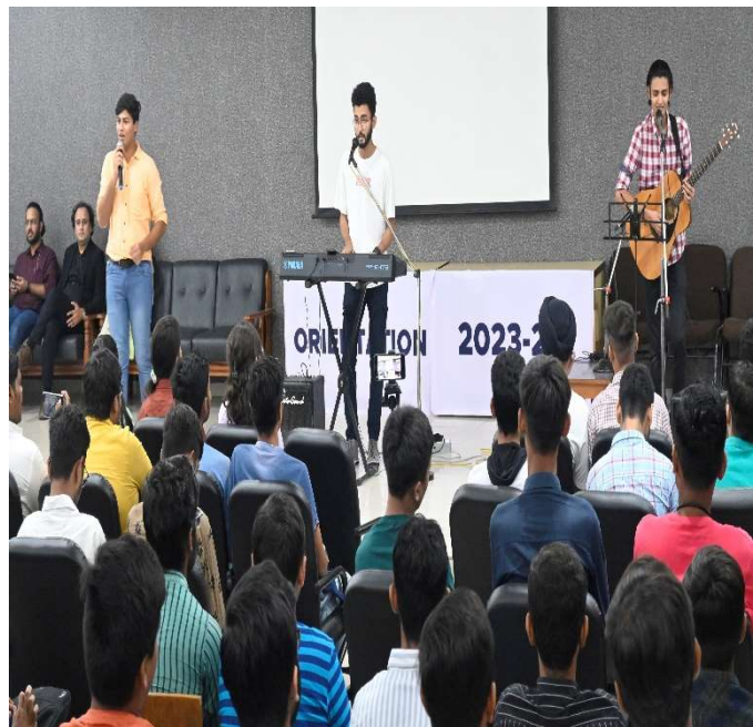
Jamming Session by Senior Students