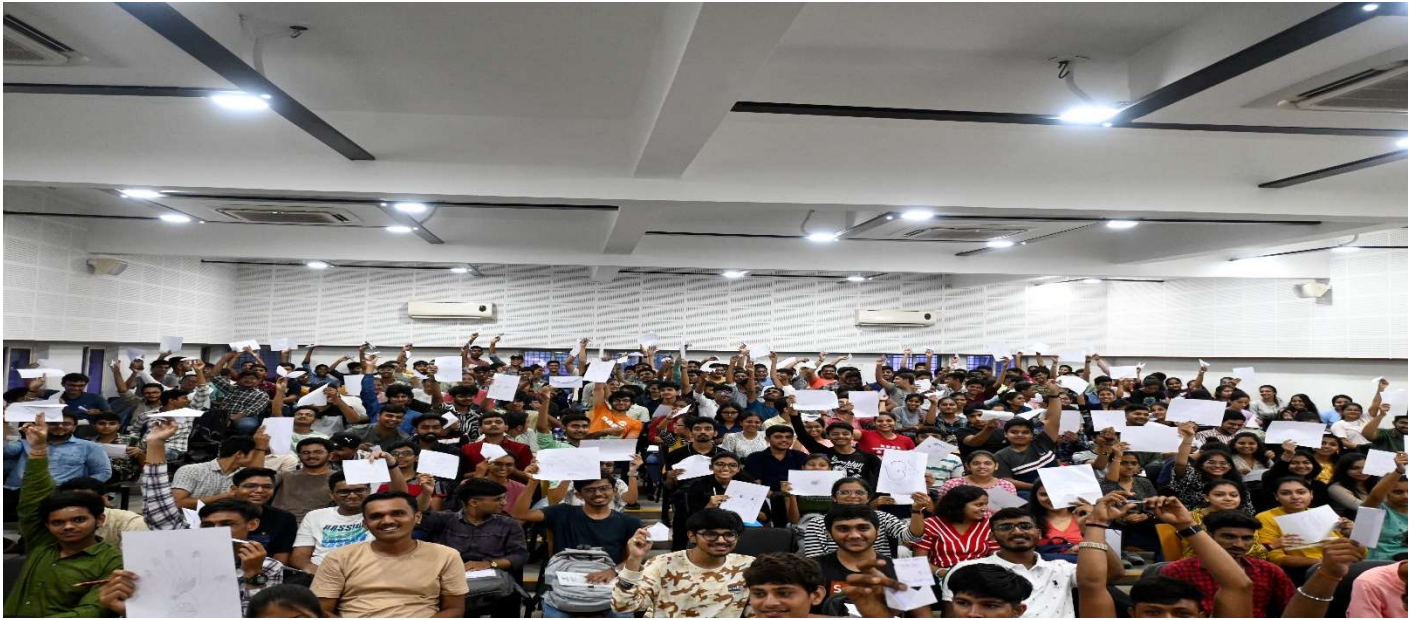
Newly Admitted Students