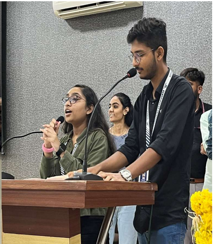
Interaction with Senior Students