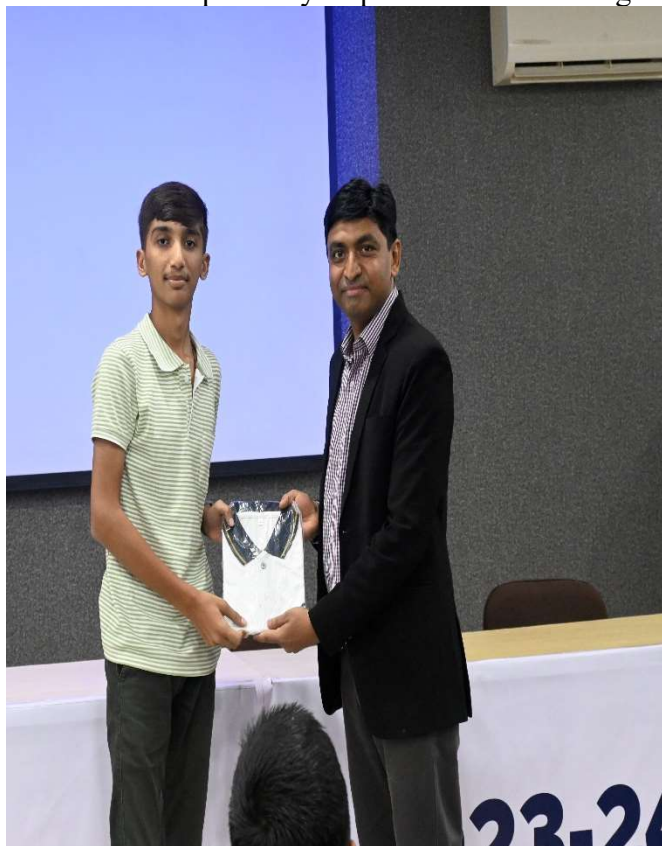
GU T-Shirt Distribution