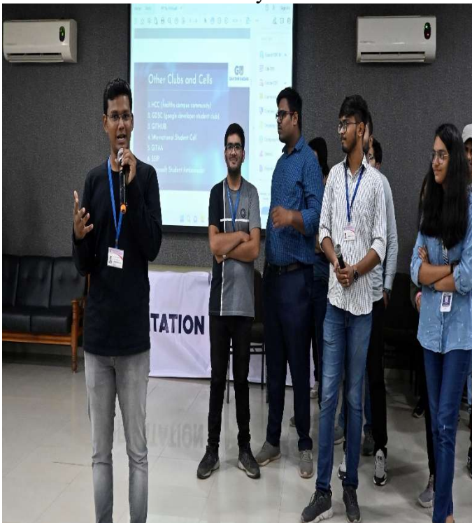
Interaction with Senior Students