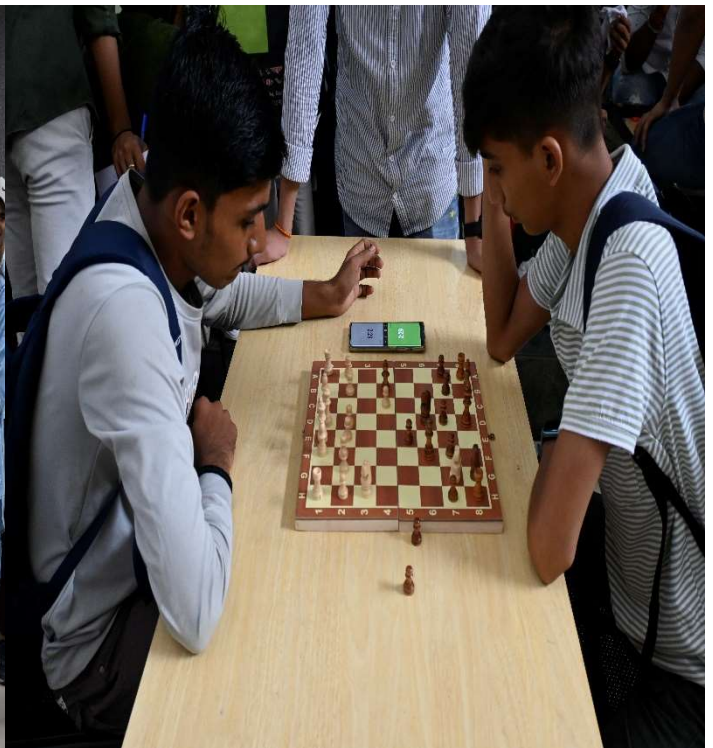
Actively participated in Sports activity by Newly admitted students