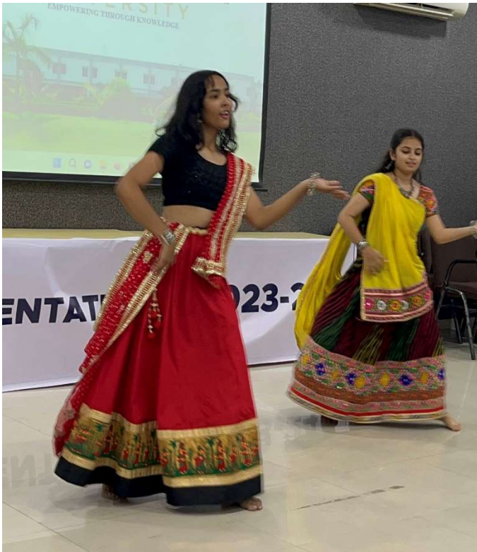
Dance Performance by Senior Students