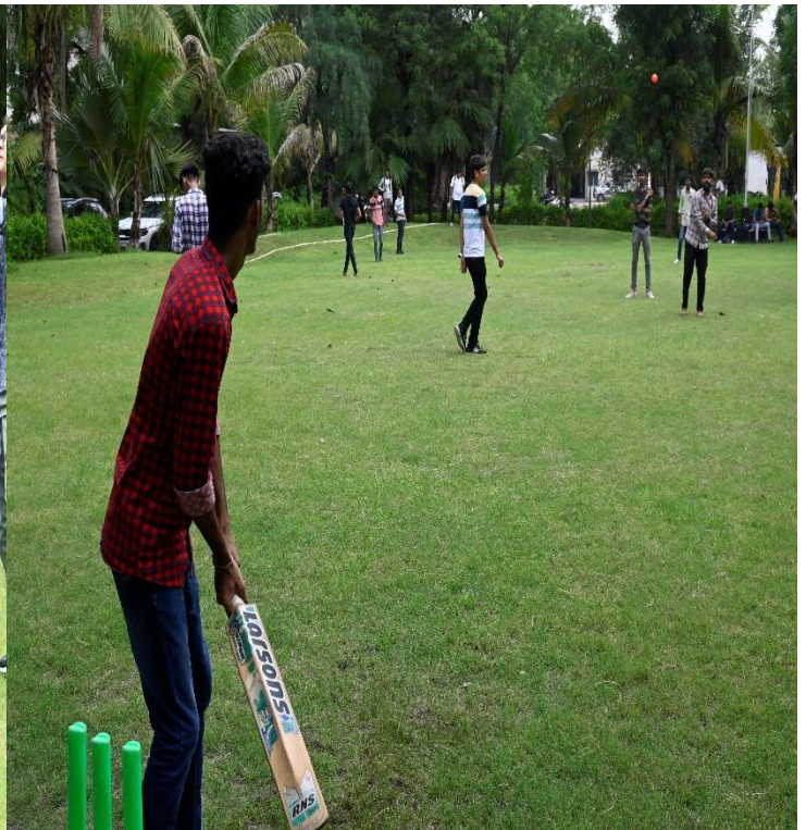
Actively participated in Sports activity by Newly admitted students