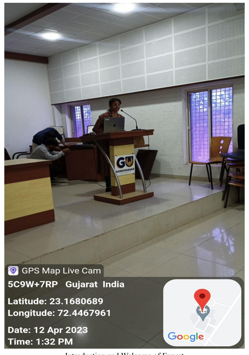
Introduction and Welcome of Expert