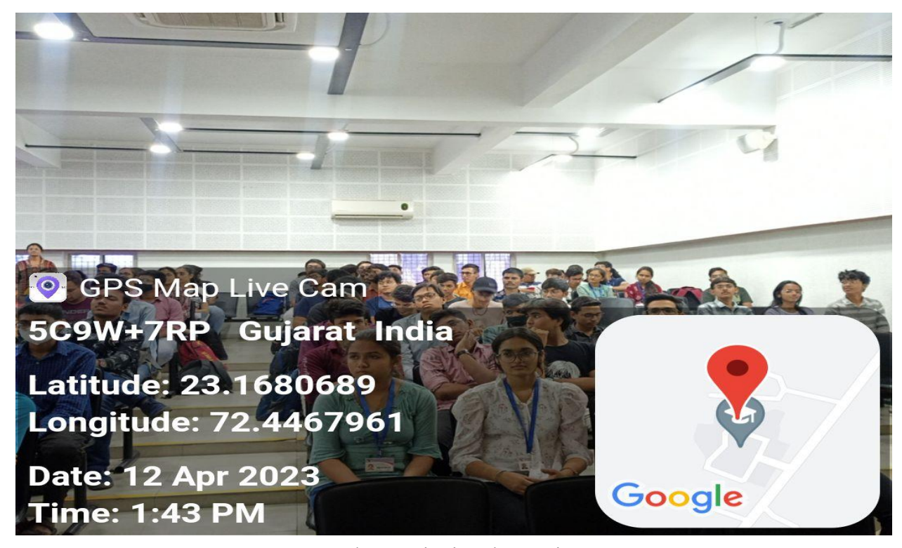
Students enjoying the session