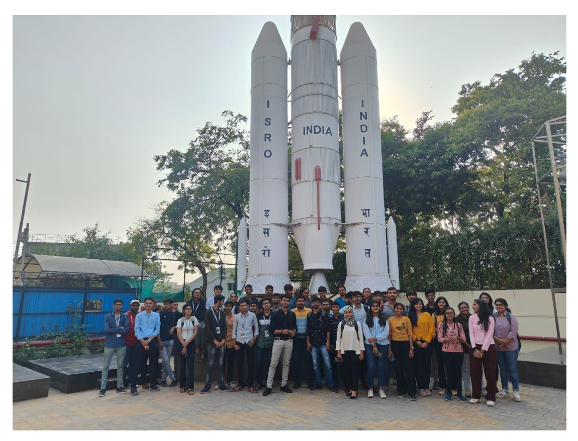
Group Photo with GSLV MK III Model